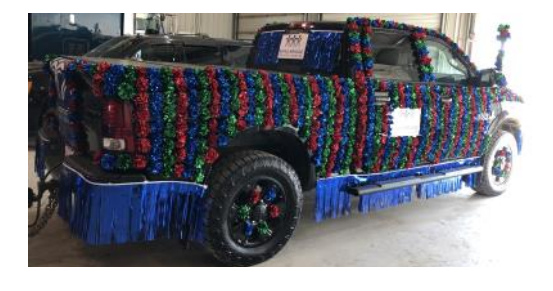
Nord-Bridge is in the 2019 Whoop Up Days Parade