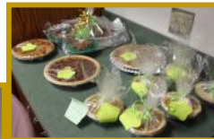
Father's Day Luncheon & Pie Auction