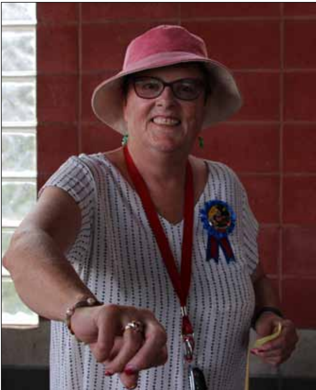
A beautiful ring from one of the staff members of Nord-Bridge for Vals retirement!