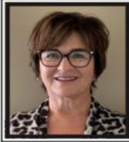
New Owner/ Operator